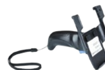
94ACC0253 Attachable Pistol Grip